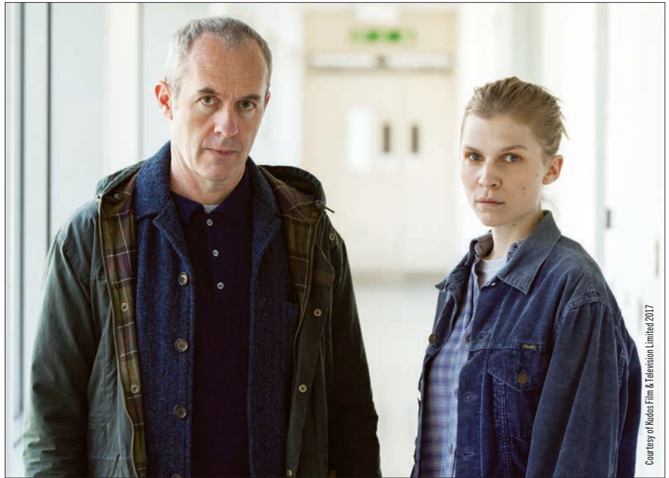
THE TUNNEL: VENGEANCE Sundays at 9:30 pm beginning July 1 Stephen Dillane as Karl and Clémence Poésy as Elise

PBS Hawai'i magazine (ISSN: 1946-0813) is published monthly by the Hawai'i Public Television Foundation, dba PBS Hawai'i. Periodicals postage PAID at Honolulu, Hawai'i and at additional entry mailing offices in Hilo, Kahului, Kailua-Kona, Kaunakakai, and Lihue. POSTMASTER: Send address changes to PBS Hawai'i, Advancement Department, 315 Sand Island Access Road, Honolulu, HI 96819-2295.