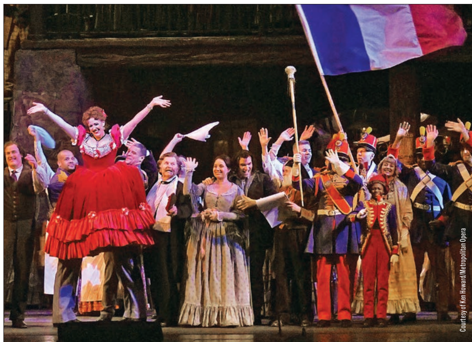
GREAT PERFORMANCES AT THE MET La Bohème Saturday, July 21, 8:00 pm A scene from Act II of Puccini's La Bohème