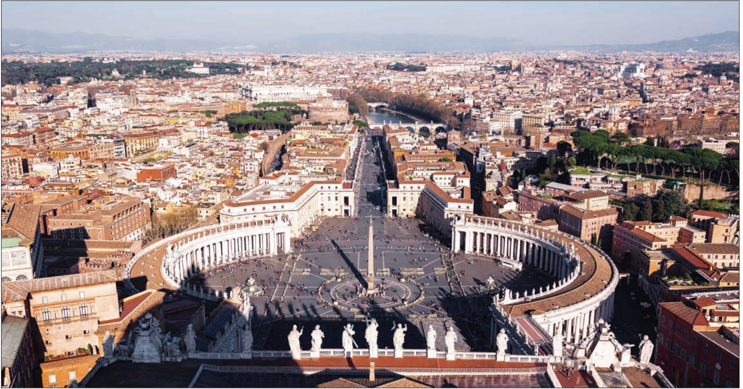
INSIDE THE VATICAN Tuesday, April 28, 9:00 pm

Rare behind-the-scenes access reveals the daily lives of those who live and work in the Vatican. Pictured: St. Peter's Square