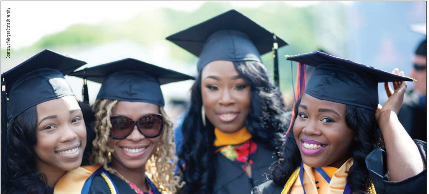
INDEPENDENT LENS Tell Them We Are Rising: The Story of Black Colleges & Universities Monday, February 19, 9:00 pm Recent graduates of Morgan State University, Maryland.

living beneath the waves into a reality as a team in Dubai attempts to construct a floating house combining the best of land and marine design. Will they achieve the impossible?