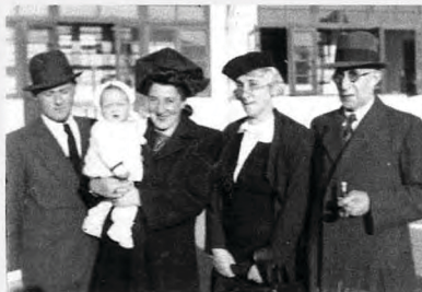
1947年全家福 A family photo, 1947