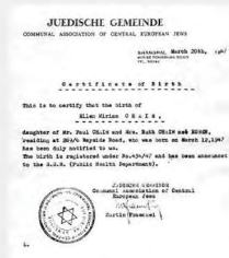
中欧犹太公会出具的出生证明 Birth Certificate from the Communal Association of Central European Jews