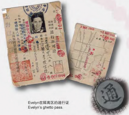
Evelyn在隔离区的通行证 Evelyn's ghetto pass.

难民在隔离区外佩戴的“通”字徽章 A little metal badge with the Chinese character Tong (May pass) had to be worn all the times outside the ghetto area.