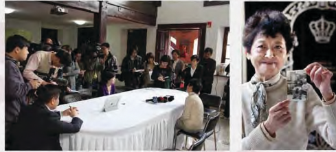
(左) “犹太女孩”寻找“上海叔叔”新闻发布会, 2011年11月28日