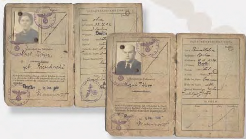
(左) Shoshana的旧护照 (L) Shoshana's old passport