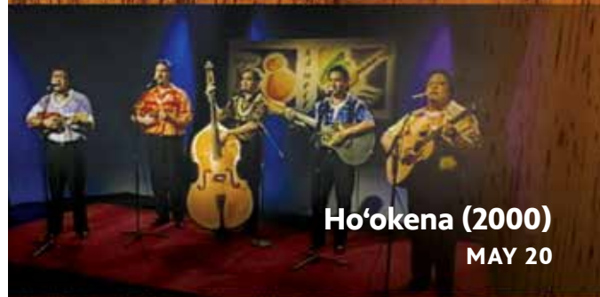
Ho‘okena (2000) MAY 20