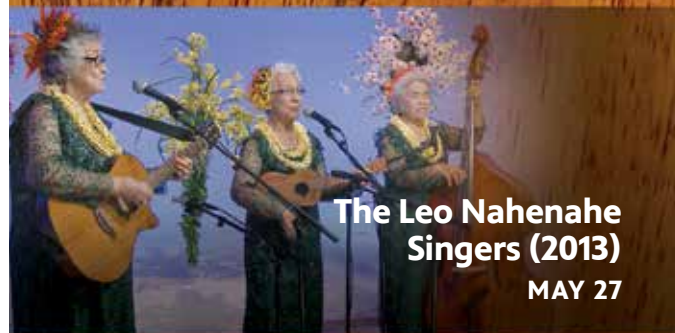
The Leo Nahenahe Singers (2013) MAY 27