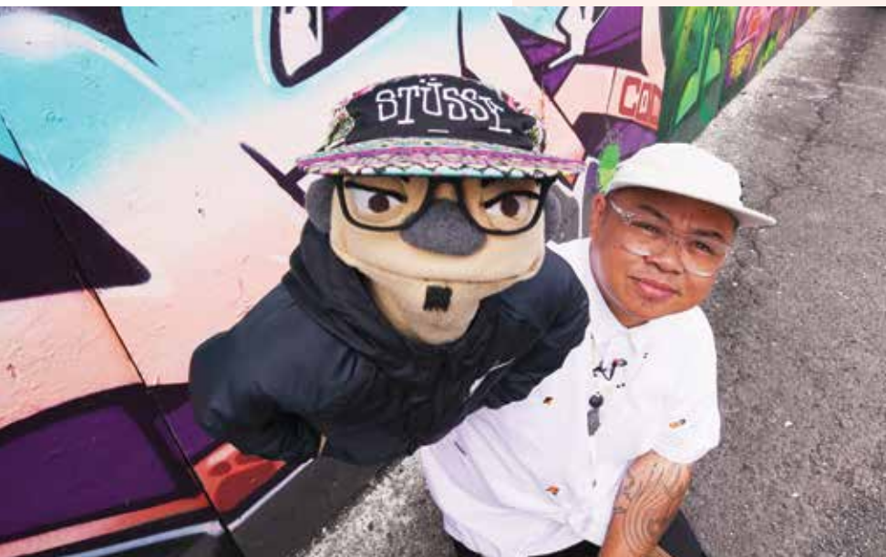
Top: A high school yearbook available as a tool for genealogy research at the Hawai'i State Library in Honolulu.