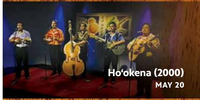
Ho‘okena (2000) MAY 20