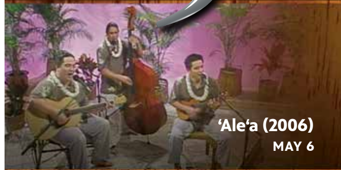
‘Ale‘a (2006) MAY 6