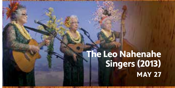
The Leo Nahenahe Singers (2013) MAY 27