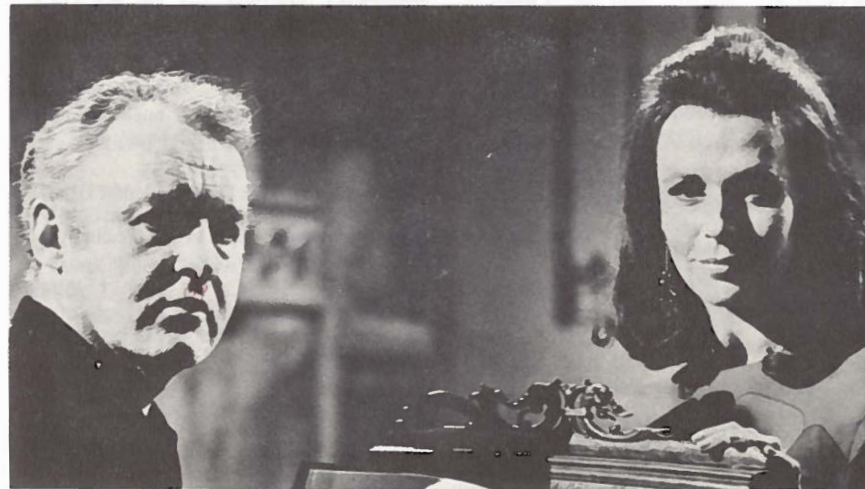
Rod Steiger and Claire Bloom in "Dark Lovers," SUNDAY SHOWCASE, Sunday, April 21, 6:30 p

8:00 p.m. N. E. T. PLAYHO A Passage To India. Dame Sybil Thornc Virginia McKenna, and Cyril Cusack star this dramatization of E. M. Forster's n about East failing to meet West in the l. of the 1920's.