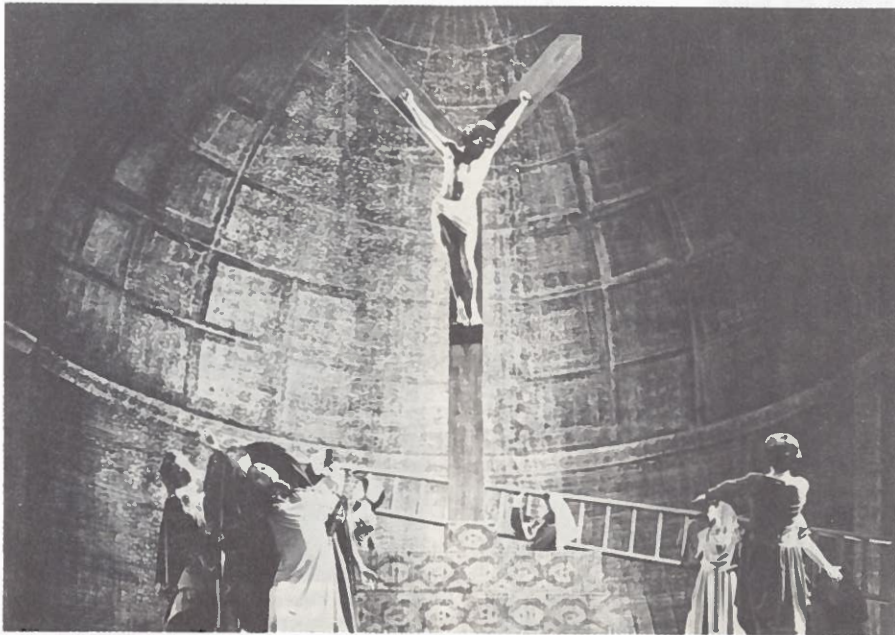
N.E.T.'s Easter special is LAUDES EVANGELII , a Miracle Play inspired by Byzantine mosaics, Giotto's paintings, and the Canticles of 13th and 14th century Italy. Sunday, April 14, 6:30 p.m.