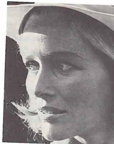
Virginia McKenna is Miss Adela Quest

Indian author Santha Rama Rau dramatizes E. M. Foster's famous novel.