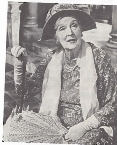
Dame Sybil Thorndike stars as Mrs. Moc in the television adaptation of E. M. Forster famous novel, "A Passage To India."