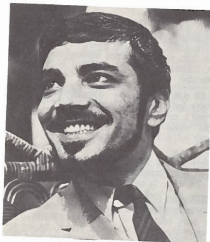
Zia Mohyeddin is Dr. Aziz