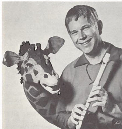
Youngsters throughout Hawaii enjoy their visits with THE FRIENDLY GIANT, Rusty (the rooster) and Jerome (the giraffe), Monday-Friday, 5:00 p.m.

4:30 p.m. MISTEROGERS' NEIGHBORHOOD Misterogers takes care of a baby chimpanzee. The makebelieve people plan an opera about a baby prince missing his mother.