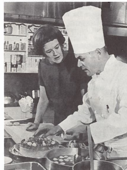
Julia Child goes backstairs at the White House in the hour-long special WHITE HOUSE RED CARPET WITH JULIA CHILD, Thursday, April 16, 7:00 p.m.