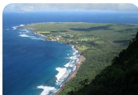
Sources: Hawai'i Department of Health, National Park Service, Hawai'i Legislature, Centers for Disease Control and Prevention, Institute Pasteur

PBS Hawai'i is bringing stakeholders together for KĀKOU: Hawai'i's Town Hall to discuss The Future of Kalaupapa . Join the live conversation on Thursday, May 28 at 7:30 pm.