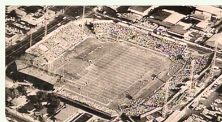
Honolulu Stadium: Where Hawai‘i Played Saturday, May 23 at 8:00 pm

Before Aloha Stadium, there was Honolulu Stadium. It was built in 1926 in Mō‘ili‘ili and was home to high school and college football games, professional baseball games, polo matches, stock car races, concerts and more. It was affectionately called the “Termite Palace” in reference to its pest-riddled wooden structure.